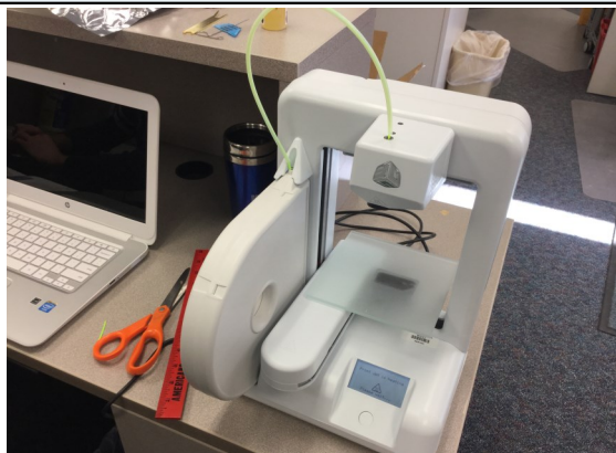
Out and About: Prepping the first print on our Cube 3D Printers!